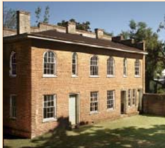
Photograph by Tim Buchman, 2003

BELLAMY MANSION SLAVE QUARTERS IN 2003 The Bellamy Mansion is a stewardship property of Preservation North Carolina